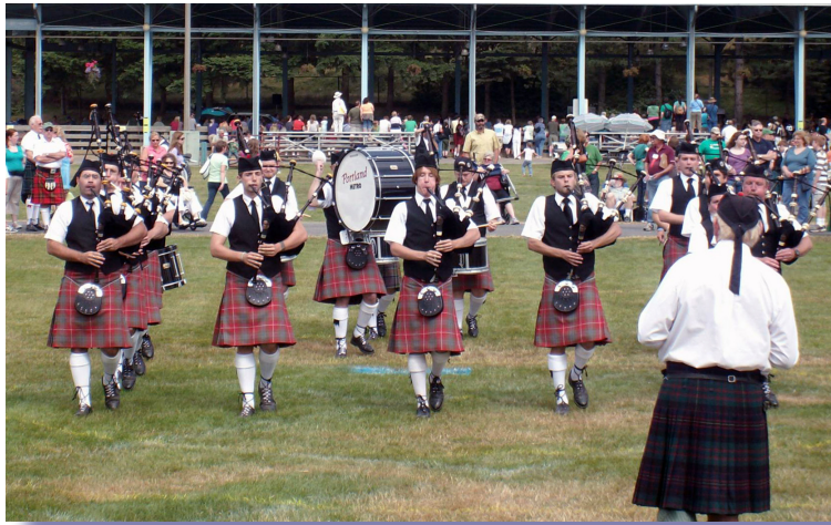
Portland Metro Pipe Band at the 2008 PNWHG in Enumclaw WA

Oregon Pipers Society is pleased to welcome back the Portland Metro Pipe Band as the guest band for March. Founded in 2006, the band finished second overall for the 2008 Grade III competition season in aggregate ratings by British Columbia Pipers Association. Portland Metro Pipe Band was selected to perform with legendary Irish band The Chieftains for their sold-out Portland show in February and will be featured at the Shamrock Run on March 15. The band's very successful Burns Night Supper in January was the first of what will undoubtedly become an annual fixture in the Portland social calendar. Plan now to attend the Supper on Jan. 23, 2010. Ticket information will be available in subsequent issues of OPS News .